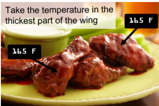
Take the temperature in the thickest part of the wing