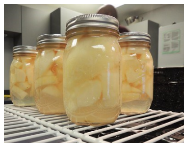
Canned pears

Pears are a favorite fall fruit. There are several varieties that are suitable for canning.