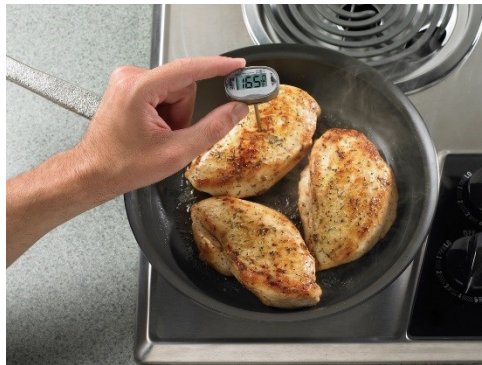
A food thermometer is a great investment for safe food!

When cooking any meat, poultry, and egg products, a food thermometer is the best tool in your kitchen to determine if the food is done and safe for consumption.