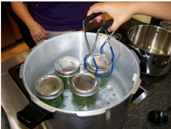
Starting with fresh food will give the best quality and flavor after canning.

A better option is to contact the original company to see if they offer smaller sizes or gift options. A small business may be able to accommodate these requests.