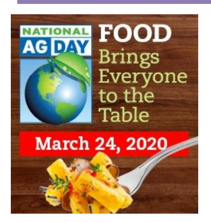
Agriculture is not just about farming and ranching. Some aspect of agriculture touches us every day!

The Kansas Nutrition Council strives to provide structure and leadership for linking Kansas professionals in nutrition and related fields.