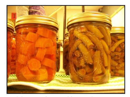
Safely canned vegetables, such as carrots and green beans, can be used in a variety of meals.

Learn more at <a href="https://nchfp.uga.edu/publications/nchfp/factsheets/heatprocessingbackgrounder.html">https://nchfp.uga.edu/publications/nchfp/factsheets/heatprocessingbackgrounder.html</a>