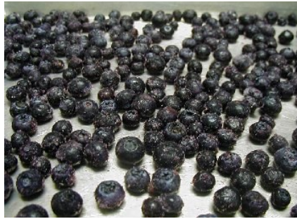
Frozen blueberries

The following tips, from the University of Minnesota Extension , will help create successful jams and jellies from frozen fruit or juice: