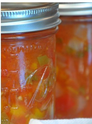
Salsa is a favorite! Use re-searched recipes for safe results.

Learn more about different vinegars from Penn State Extension .