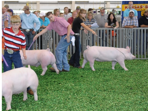
Enjoy the fair, but before you eat, wash your hands after handling any animals or being in animal areas.

County fair season is here! It's a great way to build community and have fun. Part of the fun at fairs is food so food safety is important to a successful event.