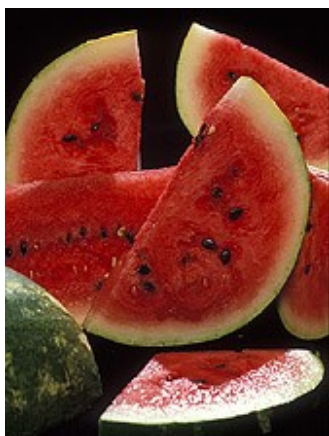
Juicy watermelon

Learn more about pickles from ILovePickles.org .