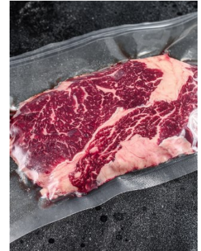
Vacuum packaged meat