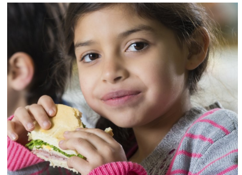
Have a great school year!

Learn more tips at www.fightbac.org/kidsfoodsafety/school-lunches/ .